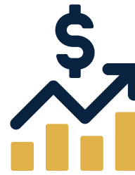
PROACTIVE TAX PLANNING